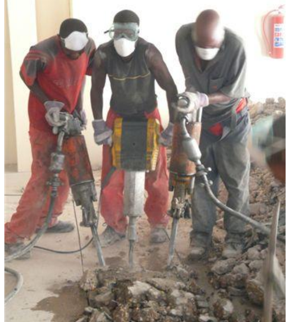
Ablution Block for workforce