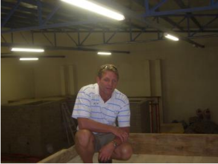
Shots as per 14.02.09